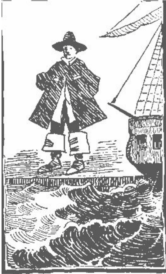
NEW YORK MAN