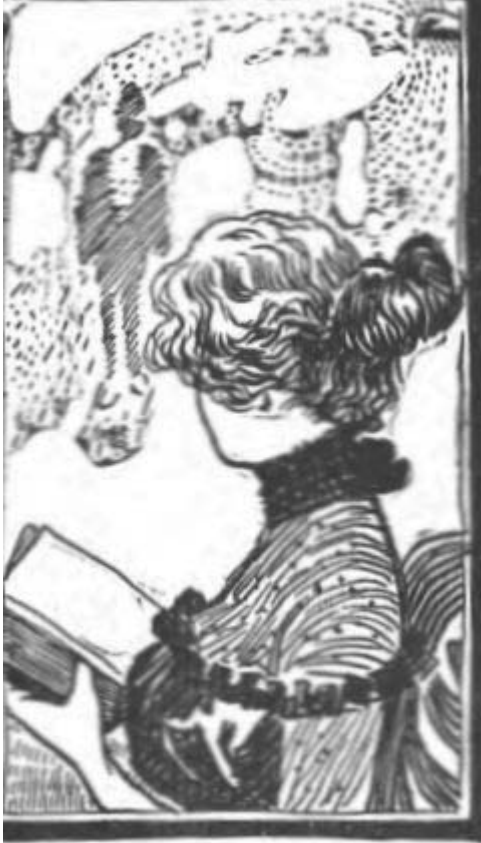
A STRANGE MAN