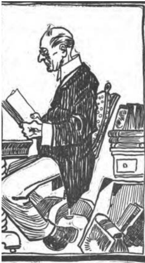
ALL A MOCKERY

You turn to the last Chapter to see if it Rains all the way through the Book. This last Chapter is a Give-Away. It condenses the whole Plot and dishes up the Conclusion. After that, who would have the Nerve to wade through the Two Hundred and Forty intermediate Pages?