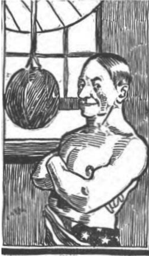
THE COMING CHAMPION