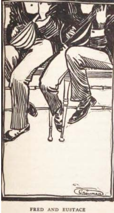
FRED AND EUSTACE

At Red Wing he would be telling her that she resembled Maxine Elliott, and showing her his Watch, left to him by his Grandfather, a Prominent Virginian.