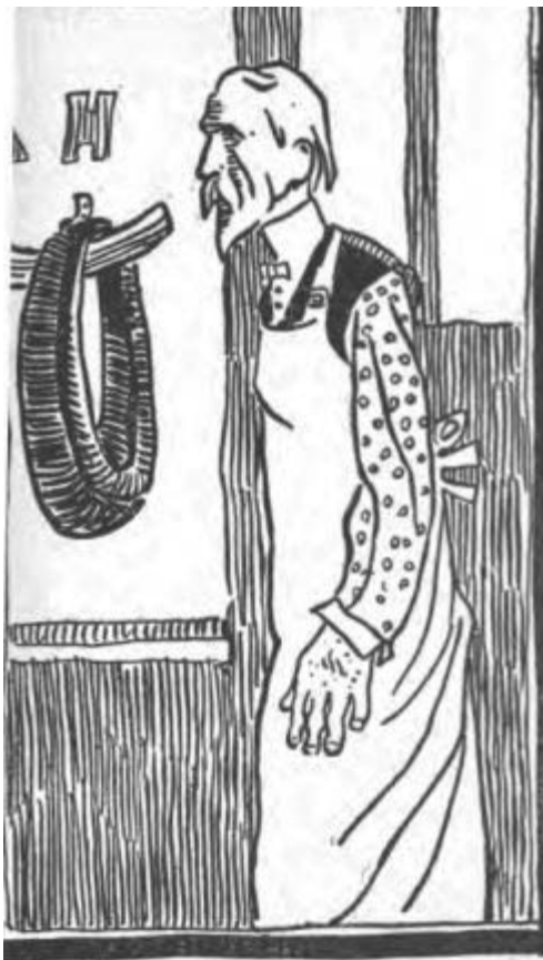
VENERABLE HARNESS DEALER

The Preacher wiped his Brow and said he had no Doubt that every one within the Sound of his Voice remembered what Quarolius had said, following the same Line of Thought. It was Quarolius who disputed the Contention of the great Persian Theologian Ramtazuk, that the Soul in its reaching out after the Unknowable was guided by the Spiritual Genesis of Motive rather than by mere Impulse of Mentality. The Preacher didn't know what all This meant, and he didn't care, but you can rest easy that the Pew-Holders were On in a minute. He talked it off in just the Way that Cyrano talks when he gets Roxane so Dizzy that she nearly falls off the Piazza.