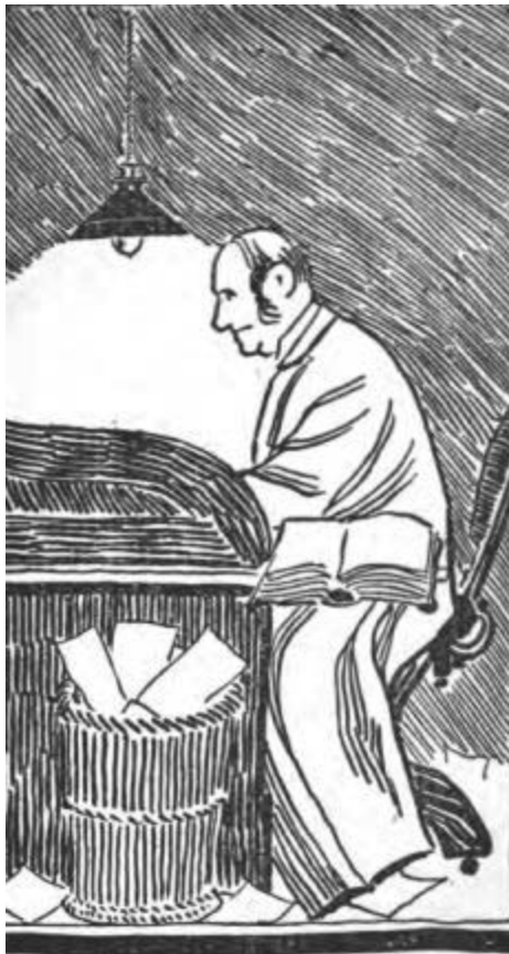
GOOD AND PLENTY

A Stout Woman in the Front Row put on her Eye-Glasses and leaned forward so as not to miss Anything. A Venerable Harness Dealer over at the Right nodded his Head solemnly. He seemed to recognize the Quotation. Members of the Congregation glanced at one another as if to say: "This is certainly Hot Stuff!"